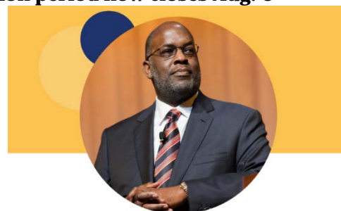
Bernard J. Tyson National Award for Excellence in Pursuit of Healthcare Equity

Award application open now through Aug. 6