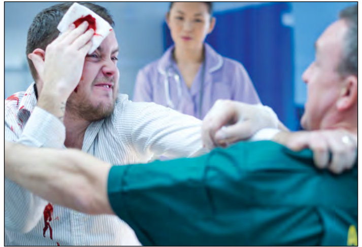
Every health care organization should expect to encounter violent behavior toward nurses, physicians, and hospital staff.