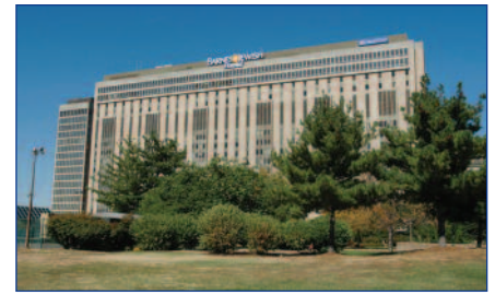
Barnes-Jewish Hospital, St. Louis.

Prevention and control of antibiotic resistance have been the main goals of