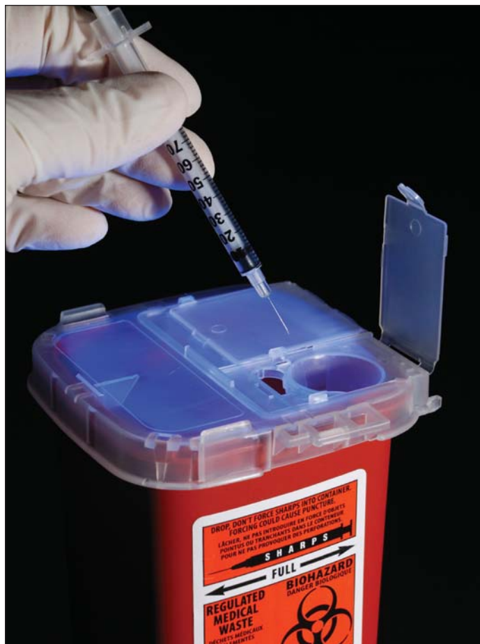
Engineering controls, like using safer devices, provide protection.