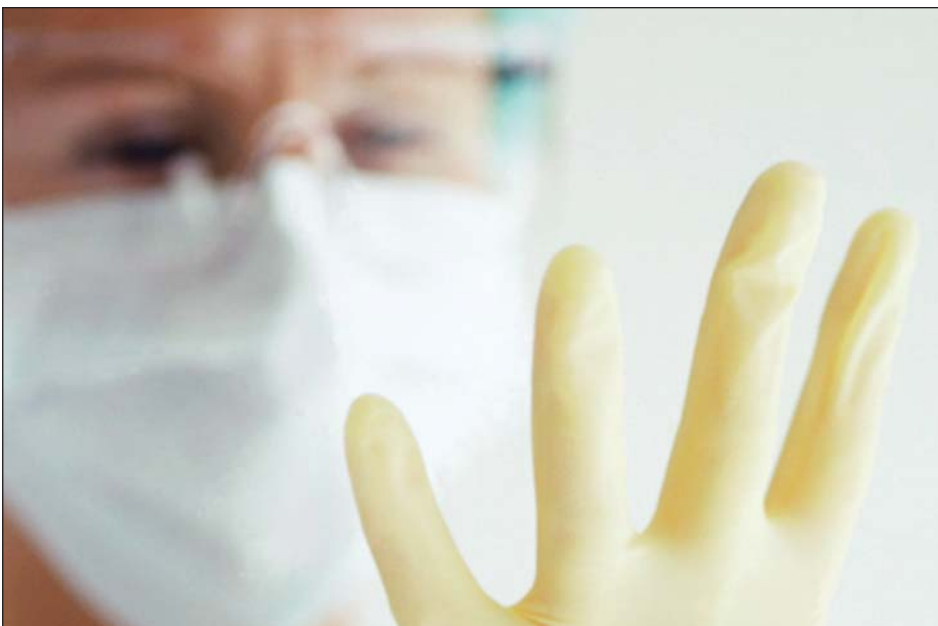
Personal protective equipment helps protect workers from bloodborne pathogens.